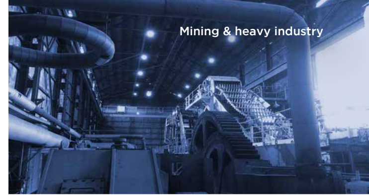
Mining & heavy industry