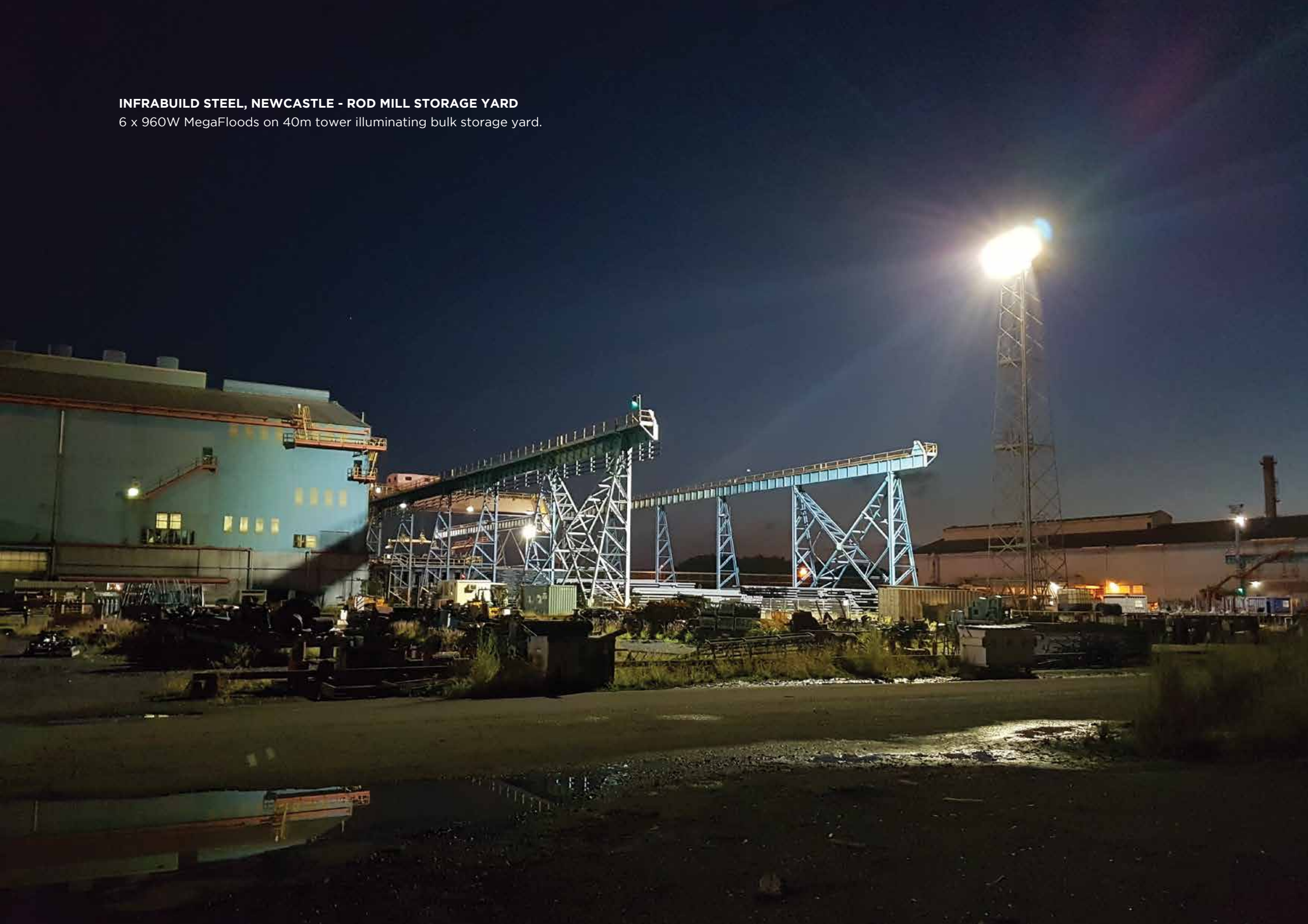
INFRABUILD STEEL, NEWCASTLE - ROD MILL STORAGE YARD 6 x 960W MegaFloods on 40m tower illuminating bulk storage yard.