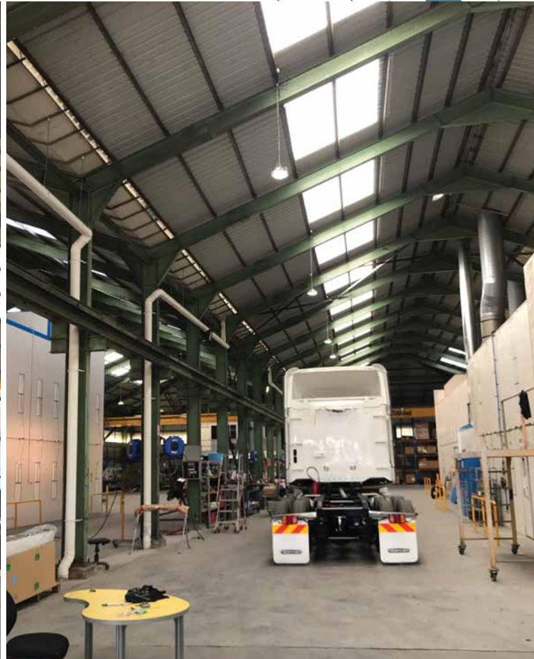
ABOVE LEFT: Primo 40K LED Highbays at 18m, illuminating the vehicle maintenance operation at Wallenius Wilhelmsen Logistics, Woolongong, NSW ABOVE RIGHT: Primo 12K Lowbays and Primo 21K Highbays in the lower ceilings at 8m. FRONT PAGE: 120W MegaFloods on walls at 6m and Primo 40K highbays in ceiling mounted at 18m, replacing 1000W MH Highbays.