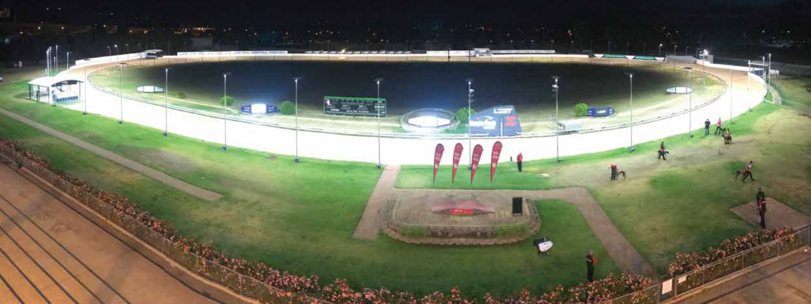
Above and right: Brilliant, uniform light from Tiger 600W MegaFloods spigot-mounted on existing 8m poles at Angle Park, SA. [Note old 1500W MH floodlights on far side of track.]