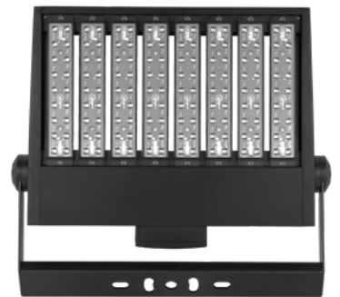
320W 44,620 lm To 1000W HID equiv