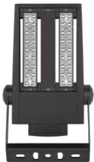
80W 11,500 lm 250W HID equiv