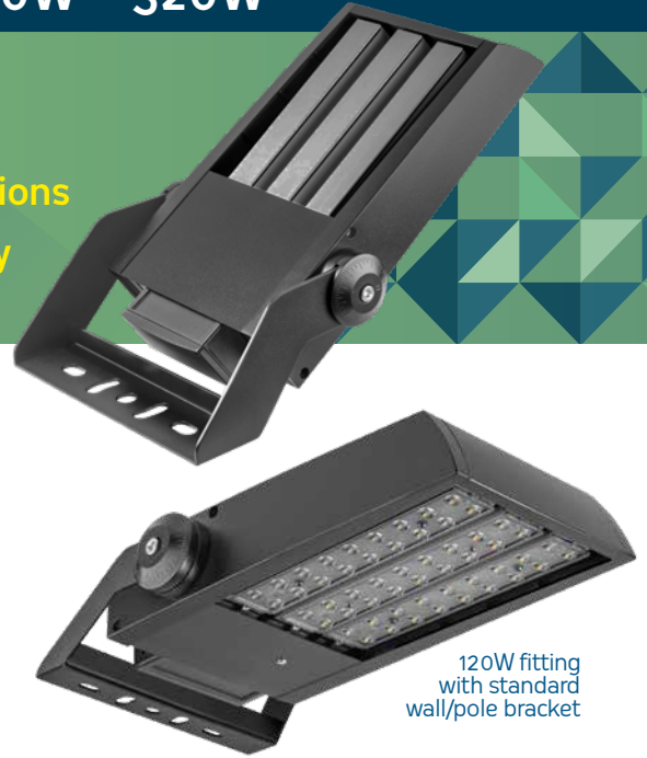
120W fitting with standard wall/pole bracket

All components interchangeable for faster assembly and local delivery