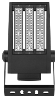
120W 17,420 lm 400W HID equiv