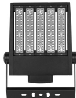
200W 29,105 lm 700W HID equiv